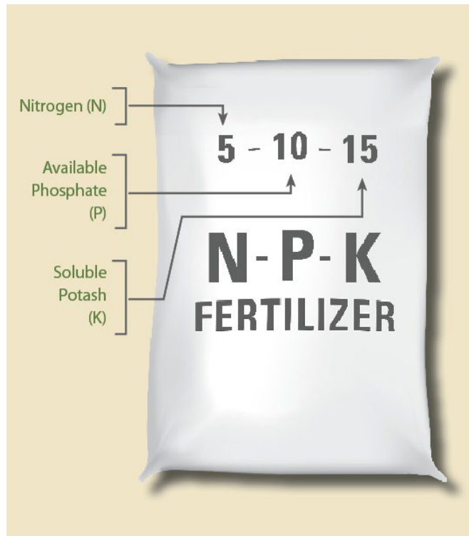
Figure 3. Fertilizer grade

The recommended nutrient rates shown on the soil test report are for the actual amount of nutrient, not the amount of fertilizer. To determine fertilizer amounts, you will need to know the fertilizer grade, the three numbers on every fertilizer (Figure 3). Grade or number equates to the percentage of total N, available phosphorus ( P_2O_5 ) and soluble potassium ( K_2O ) present. For example, if a fertilizer is labeled 5-