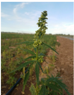
Industrial Hemp Fiber