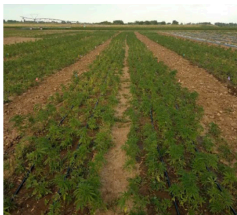
Industrial Hemp Seed & Grain