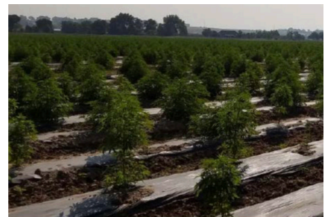
Industrial Hemp CBD

For more information, please visit http://hemp.agsci.colostate.edu