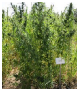
Industrial Hemp Seed & Fiber