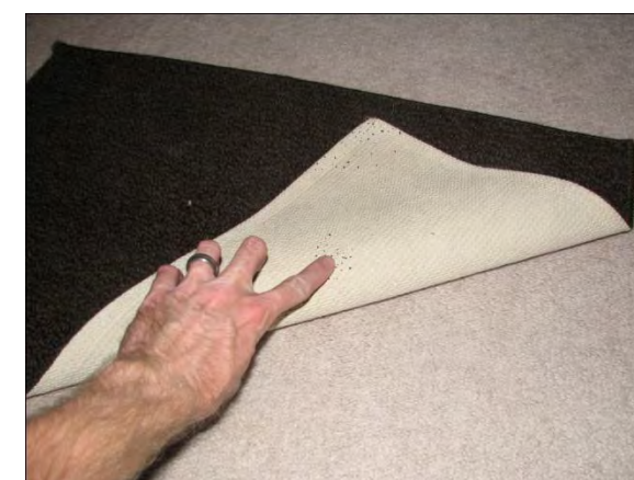
Bed bug fecal spotting on the bottom of a rug.