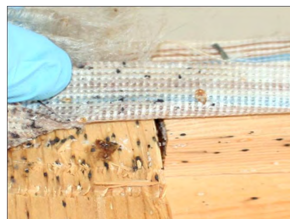
Bed bug adults, nymphs, cast skins and fecal spotting on the bottom of a box spring.