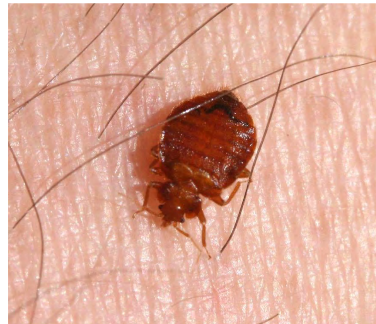
Adult bed bug settling on a human arm to feed.

However, immature stages that have recently hatched are much smaller and a range of sizes representing different life stages are normally present. The smaller stages of bed bugs are lighter brown than the adults and a dark area may be visible in the center of the body.