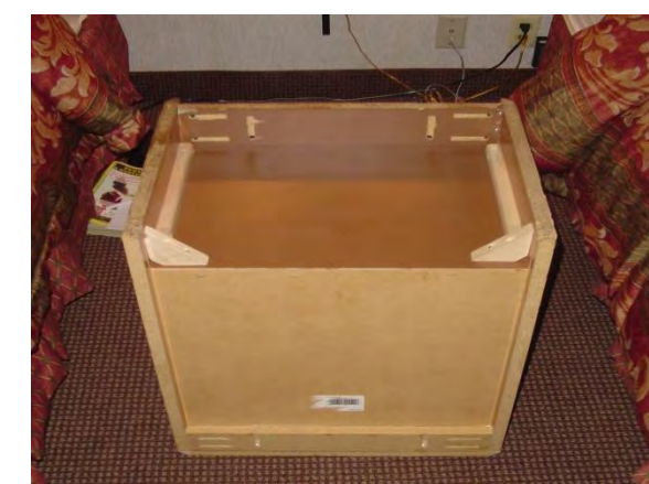
Bed bug hiding areas on the underside of a nightstand.