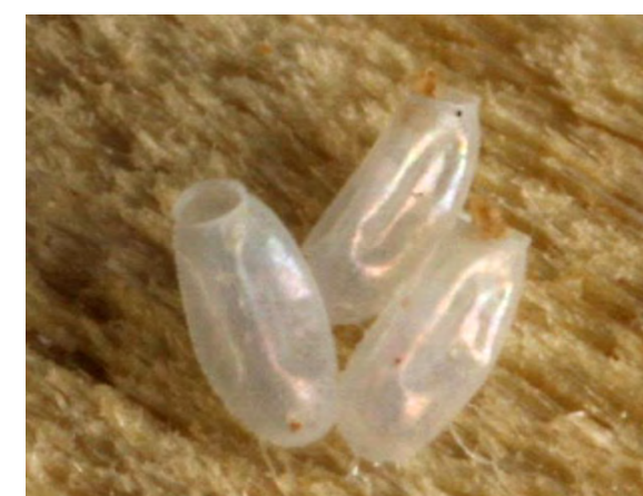
Hatched bed bug eggs.

Bed bugs tend to group in dark enclosed areas to rest between feeding events. These aggregation sites may be indicated by spotting produced by bed bug excrement, oval cream colored eggs, old skins from molted bed bugs as well as various active life stages.