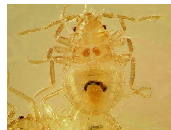
Newly hatched bed bug nymph.