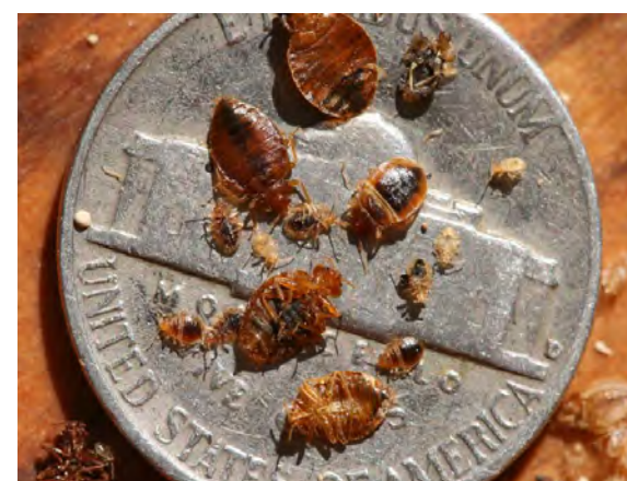
Various life stages of bed bugs.