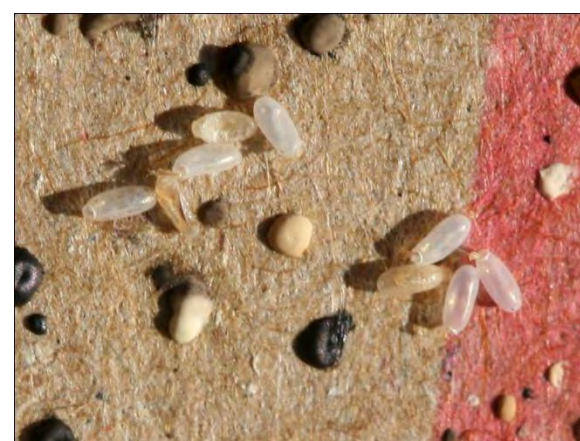
Bed bug eggs and fecal spotting.

Where would I find bed bugs? The great majority of bed bugs will be on or in the near vicinity of sleeping sites used by humans. Bed bugs feed at night, always avoiding light, and spend the rest of the time tucked in cracks and crevices such as mattress seams and box springs, corners of bed frames and side tables, or behind molding and pictures.