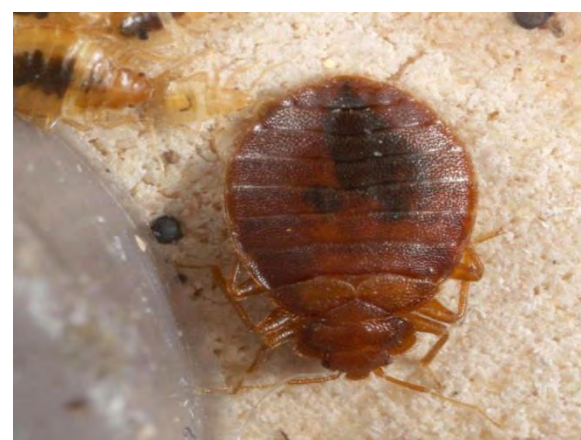
Bed bug nymphs.

Bed bugs tend to group in dark enclosed areas to rest between feeding events. These aggregation sites may be indicated by spotting produced by bed bug excrement, oval cream colored eggs, old skins from molted bed bugs as well as various active life stages.