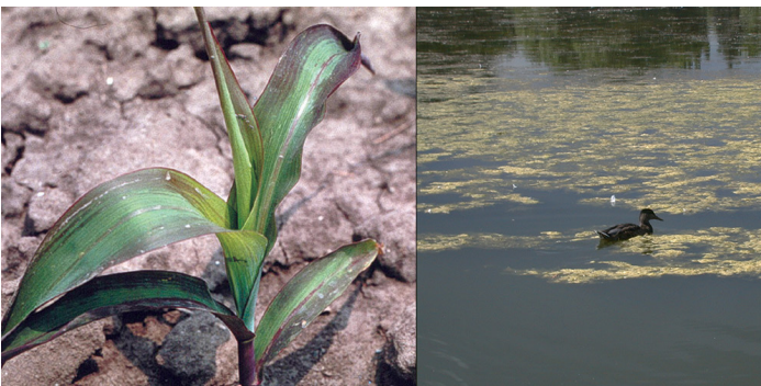
Insufficient phosphorus (P) in crop fields can cause deficiency symptoms and reduce yield (left image). Excess P can cause water quality degradation if runoff reaches water bodies (right image).

Water quality problems associated with P are generally confined to surface water. Phosphorus in most Colorado soils is tightly held to soil particles and does not leach to groundwater. However, the P held in organic phases from residues such as manure can dissolve in water and be lost if improperly managed. Adsorbed P on soil particles can cause surface water contamination as P containing sediments move off the land in agricultural runoff. When large amounts of nutrients enter lakes and streams, they accelerate the natural aging process, or eutrophication, by enhancing the growth of algae and other aquatic weeds. As these plants flourish, depleted oxygen and light reduce the survival of more desirable species and the natural food chain declines. Eventually, impounded waters such as lakes, ponds, and reservoirs become overgrown with aquatic vegetation and die.